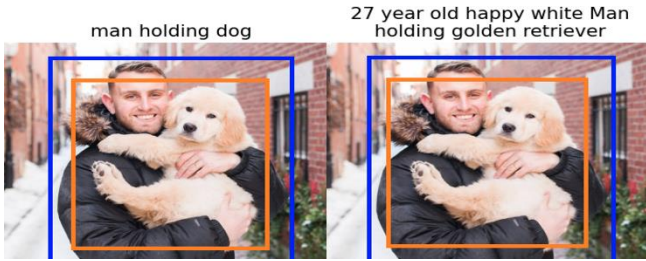
Figure 2. RelTR and Ours (right)